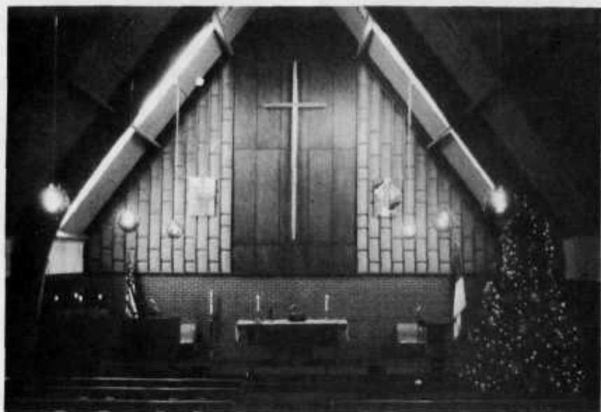
New church interior