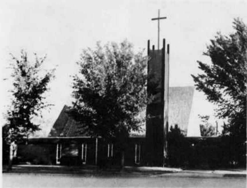
Present church dedicated, March 7, 1971.