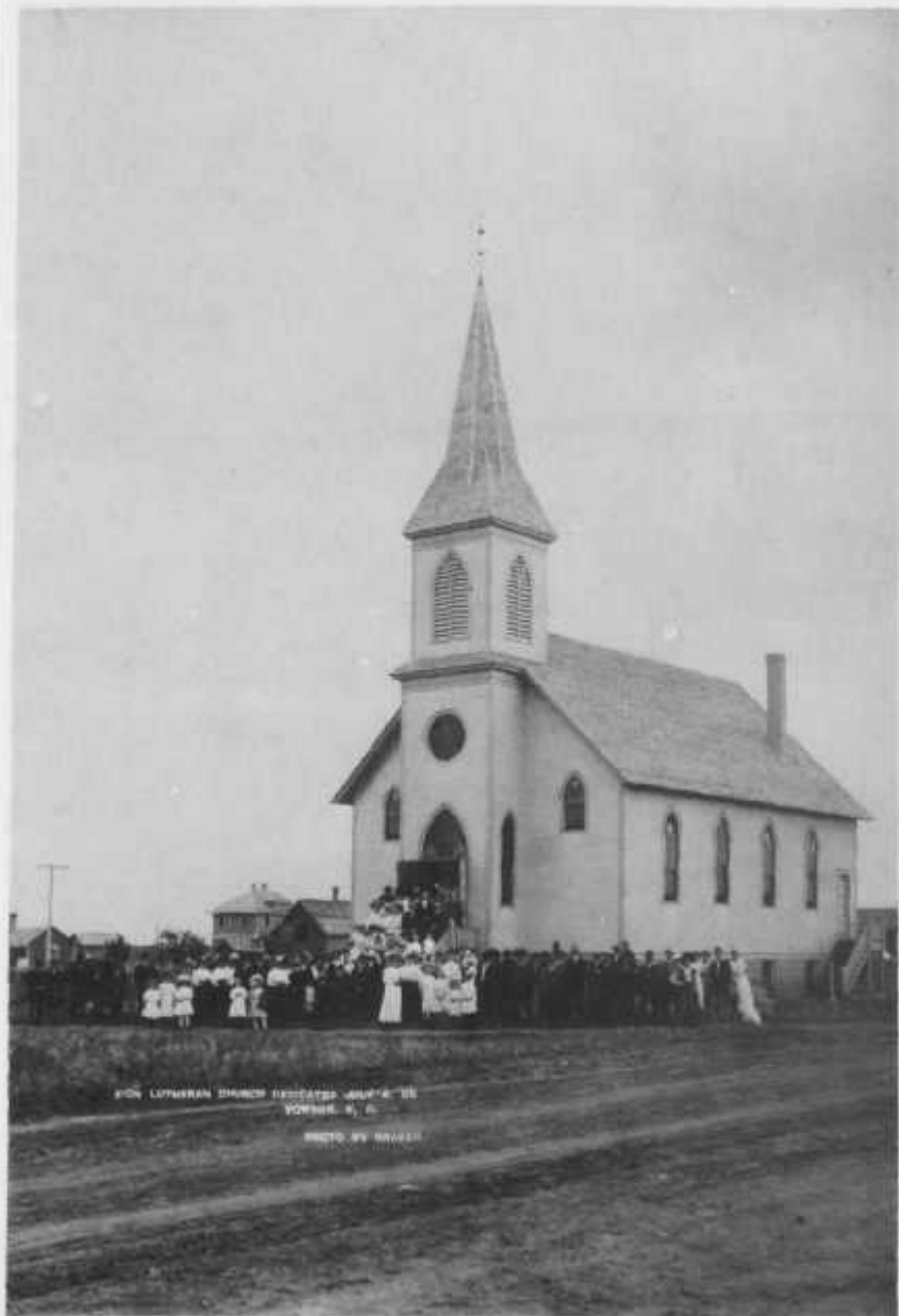
Dedication of Church - 1909