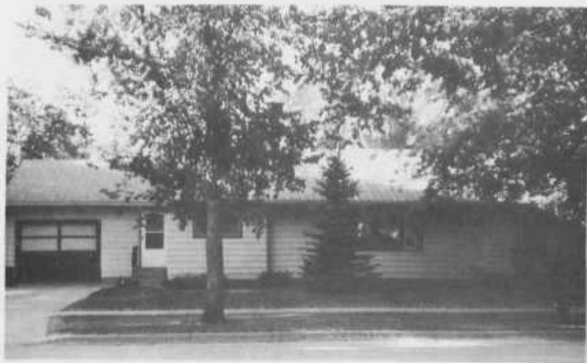
New Parsonage - built in 1960