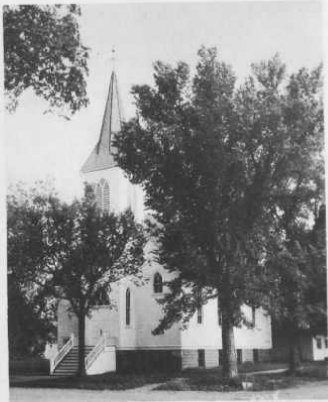
Old Zion Lutheran Church & Church Interior 1952