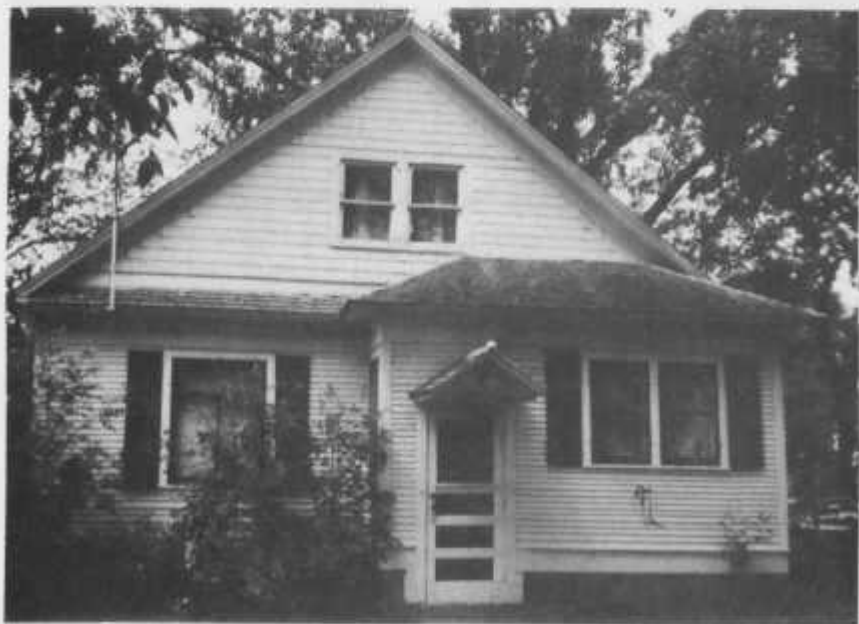
Old Parsonage - bought in 1923