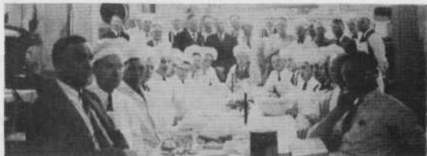
Walters and cooks at lutefisk supper

At the present time, the Lutheran, Presbyterian and Catholic men and others in the community are having Men's Prayer Breakfasts and Bible Study weekly.