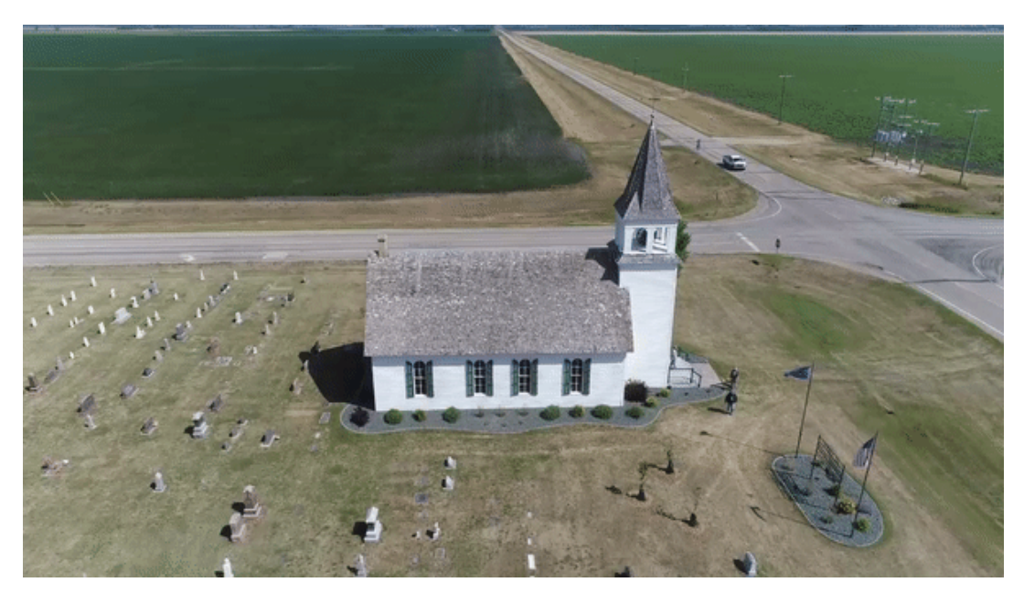
St. John's Lutheran Church on Highway 81 near Galchutt, ND.

St. John's Lutheran Church started their congregation in 1872.